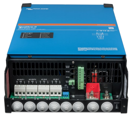
Connection Area Quattro-II 48/5k